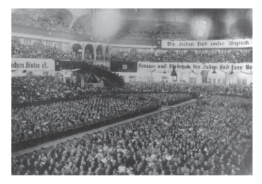
The photograph on the jacket of the American edition was taken on August 15, 1935 in a sports palace in Berlin where Adolf Hitler and Julius Streicher, Germany's most rabiatic anti-Semites, delivered their speeches. Not exactly a representative image of the German people.

attitudes during the Nazi period" to emphasize that "to be an anti-Semite in Hitler's Germany was so commonplace as to go practically unnoticed" (p. 32). The omission of Kershaw's actual conclusion creates the impression that this statement may be taken for it. The sentence in question is to be found in Kershaw's last chapter, concerning popular opinion and the extermination of the Jews. A flaw in the transcription of this sentence is not without significance : in Kershaw (p. 370) we find "to be anti-Semitic" and not "to be an anti-Semite". In the chapter referred to, Kershaw discusses the year 1944 when hardly a single Jew was left in Germany. The younger generation, who had no more opportunity to see a living Jew, was crammed with anti-Jewish slogans. It was becoming ever more difficult to keep the hatred for an abstraction alive. After this comes the sentence quoted by Goldhagen with, in a footnote, a suggestion to compare with a passage in Albert Speer's Erinnerungen (Memoirs). In the section indicated by Kershaw, Speer tries to explain how it was that he did not know, did not wish to know, about the extermination of the Jews <sup>92</sup>. By this reference Kershaw must have meant that in Nazi Germany even a minister could walk around with his eyes closed.