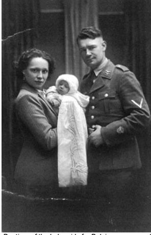
Baptism of the baby girl of a Belgian woman and a "Wehrmacht" soldier.