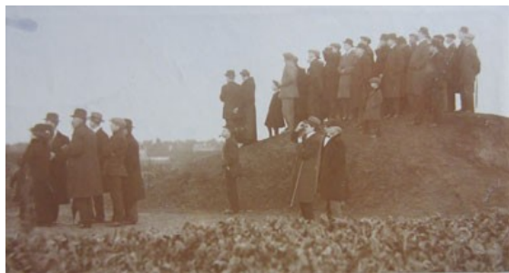
At the end of the summer of 1914, Brussels has been invaded by the Germans. Alerted by the noise of the guns, the population of Schaerbeek tries to see the fights that continue outside the town centre.

This approach of the war through photography – now considered a historical source in its own right – is original in that it proposes a totally different way of understanding daily life during this troubled period. Indeed, beyond obvious limitations, photography highlights aspects of experiences of the occupation that have often remained unexplored. These photographic trajectories transform and enrich our perception of Brussels and the Walloon cities during the war.