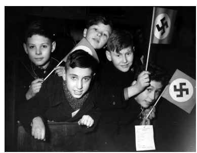
Belgian children return to Brussels after spending a six month vacation in Germany under the wing of the "DeVlag", February 28th, 1944.

Belgium WWII presents the war past in different formats, adapted to the varied public. Among them, there are the "war portraits": life stories of Belgians who have experienced the Second World War in their own specific way. Photographs, letters and audiovisual sources will bring these stories to life. These key documents give a good impression of the real impact of war on the life of known and lesser-known Belgians. This bottom-up approach introduces the visitor to our history of the war.