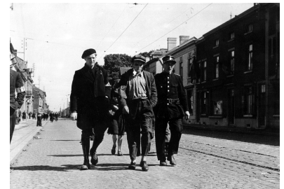
Répression et exécution de collaborateurs, 1944